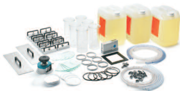
Horizon FTS Accessories

© 2011 Thermo Fisher Scientific Inc. All rights reserved. All trademarks are the property of Thermo Fisher Scientific Inc. and its subsidiaries. Results may vary under different operating conditions. Specifications, terms and pricing are subject to change. Not all products are available in all countries. Please consult your local sales representative for details.